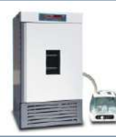
Temperature & Humidity stability chamber