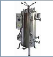
Vertical / horizontal Autoclave