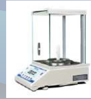
Analytical / laboratory Balance