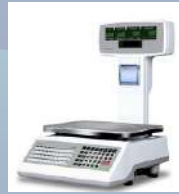
Computing + Label Printing Scale