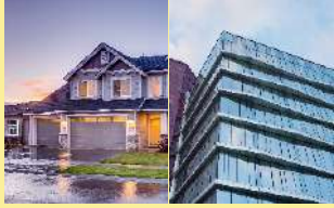
Residential & Commercial