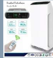
Portable Air Purifiers