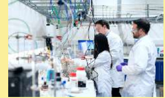
Research & Laboratory