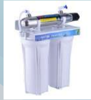
UV Filter System