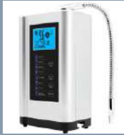
Alkaline Water machine