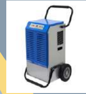
Industrial Portable Dehumidifier