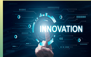
Focus on Innovation