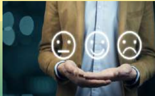
Respect of the client needs, culture, identity & objectives