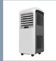
Portable Air Conditioners