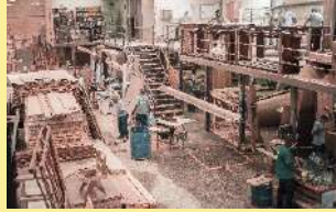
Manufacturing & packaging