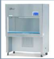
Laminar air flow Chamber