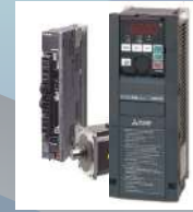
VFD and Servo Drives