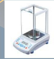
Semi - Micro - Balance